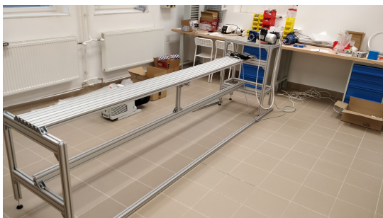
(a) Frame of the winding machine

Compared to the Section 5. of [3] improvements have been made on every aspect of the topic. The necessary infrastructure for the production is being built in Wigner Research Centre for Physics. The current state of the winding machine is shown in Fig.2. The rotation speed of the motor can be controlled in both directions by foot pedals. The motor will drive a long shaft holding the so called formers of the superconducting magnet. The superconducting wires will be wound into the grooves machined into these formers.