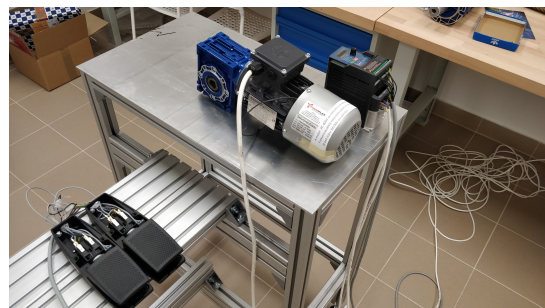
(b) The motor and the control pedals