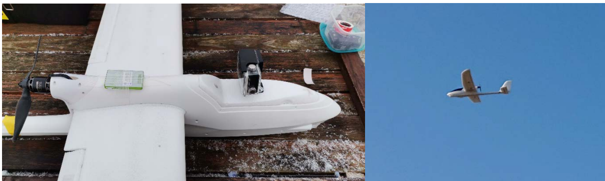
Figure 2: GPS-camera setup of the glider (left) and A frame from the test flight (right).

Besides analysing the GPS data set, I assembled and flew the R/C (Radio control) model glider which is an important research aim for the MTA-ELTE 'Lendület' Collective Behaviour Research Group. In order to provide longer and safe flight, high-performance electric motor and servo assembled to the glider. The current propulsion system of the glider generates 1.3 kg thrust, but the same motor can generate 1.8 kg thrust by changing the battery. Although the suggested thrust-weight ratio for the powered sailplanes is 0.3 [2], the thrust-weight ratio of our glider is around 1. These parameters ensure us longer endurance of flight and a higher payload capacity. We did the flight tests in the controlled airspace of Farkashegyi airport (Figure 2). These flights confirmed that the glider is able to carry the necessary equipment for further experiments. This flight was recorded with a high-resolution GPS to learn about the glider's performance (Figure 3). According to GPS recordings, the glider reached the maximum altitude of 207 m from the ground level during the flight. In the test flights, I manually controlled the glider.